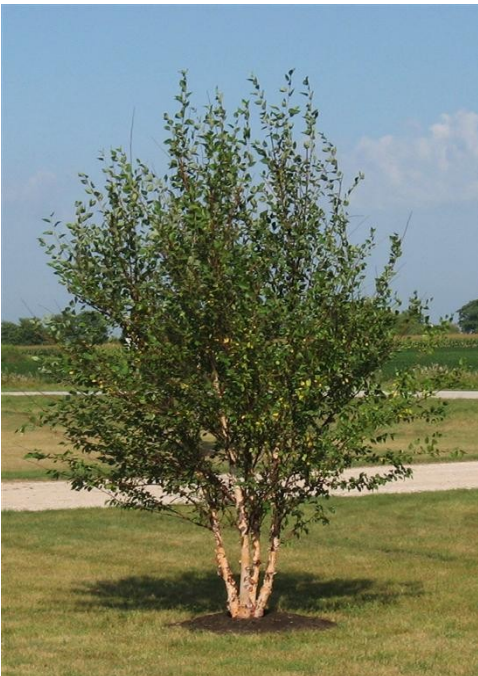
Figure 22: River Birch