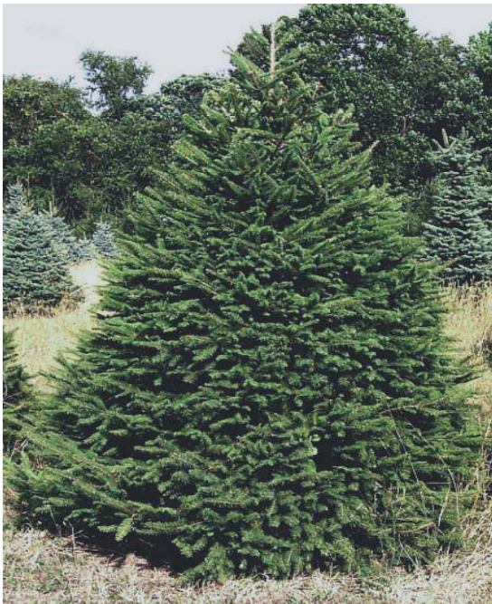
Figure 16: Norway Spruce