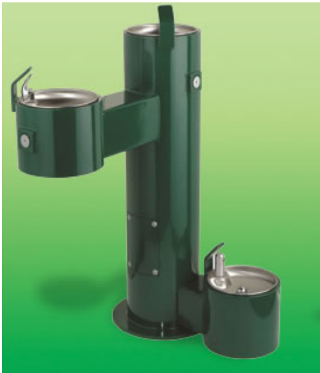
Figure 13: Human and Dog Water Fountain, installed to pass muster with water connection requirement