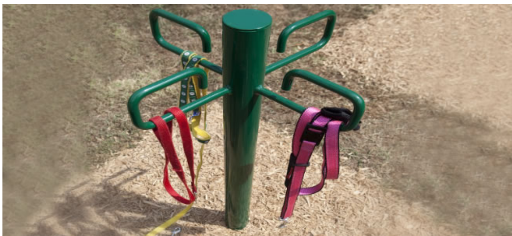
Figure 11: Leash Post, one for each park