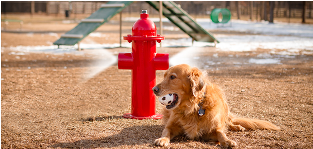
Figure 12: Misting Fire Hydrant, both dog parks, if possible with water line connection