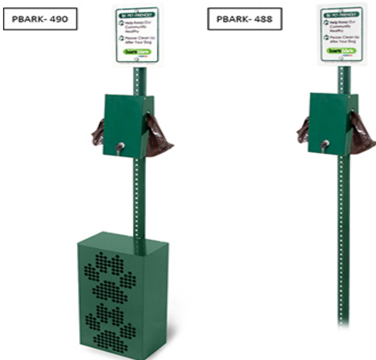
Exhibit D: Dog Waste Disposal Stand