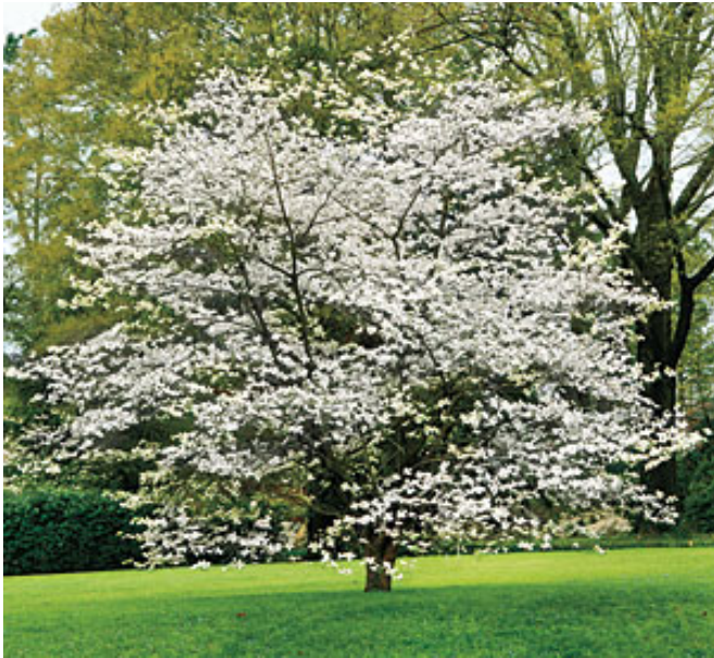
Figure 14: Dogwood Tree