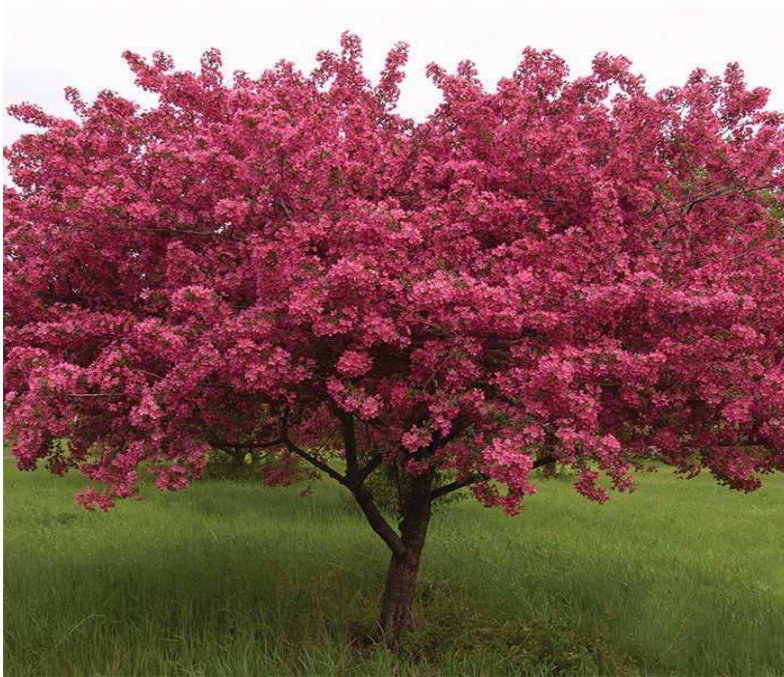
Figure 26: Prairifire Flowering Crabapple