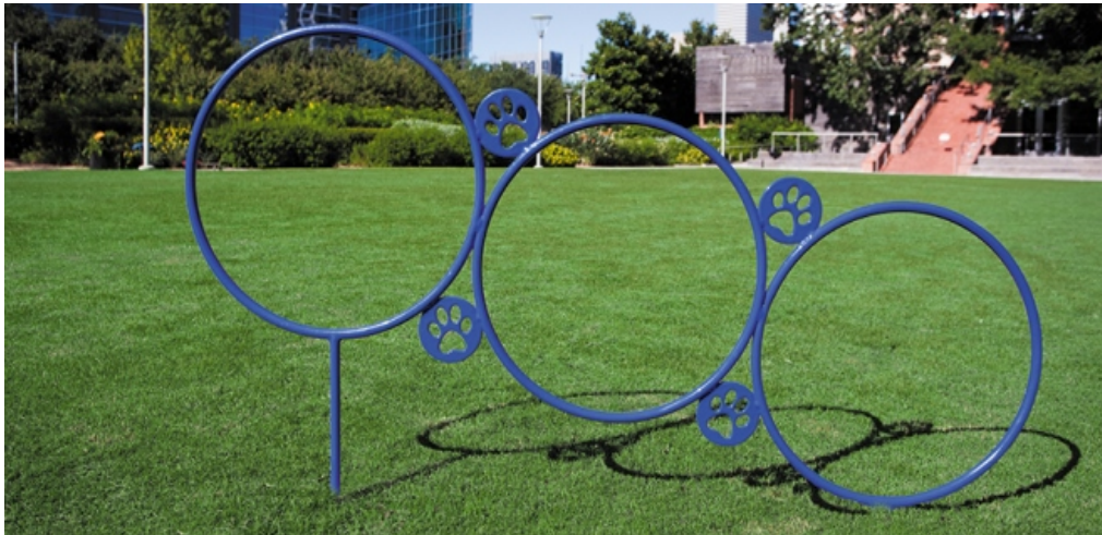
Figure 10: Small Dog Hoop Jump