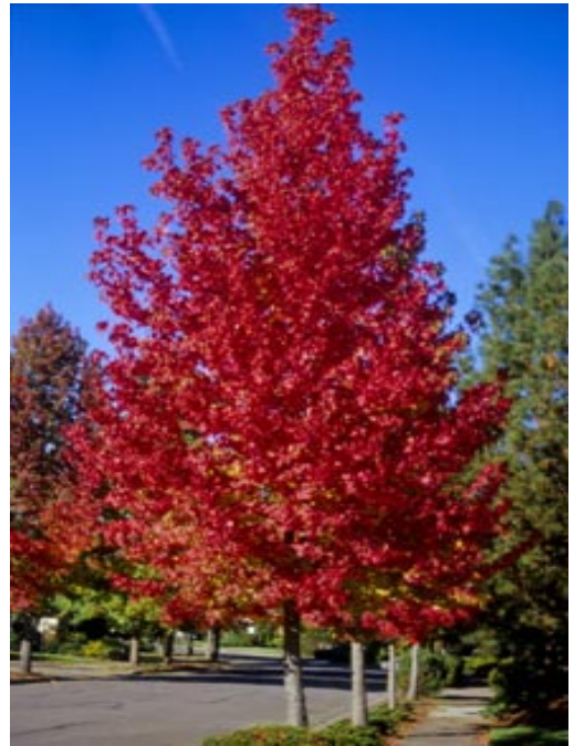
Figure 24: Sweet Gum Tree