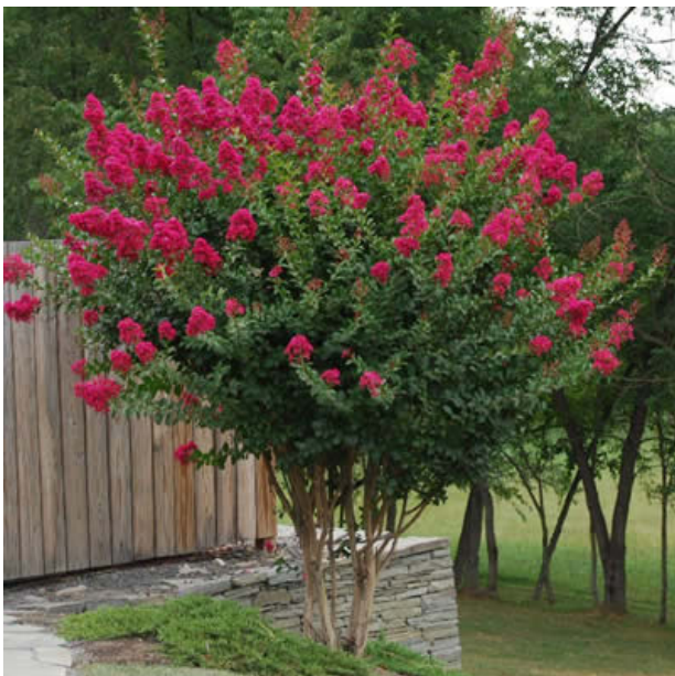
Figure 25: Crape Myrtle