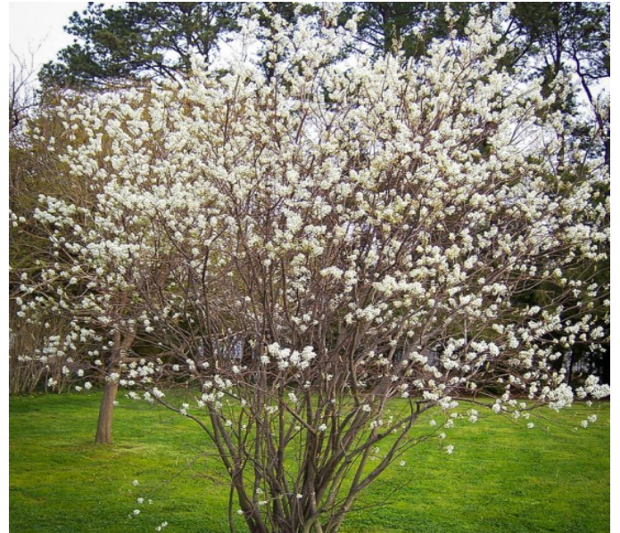
Figure 18: Serviceberry