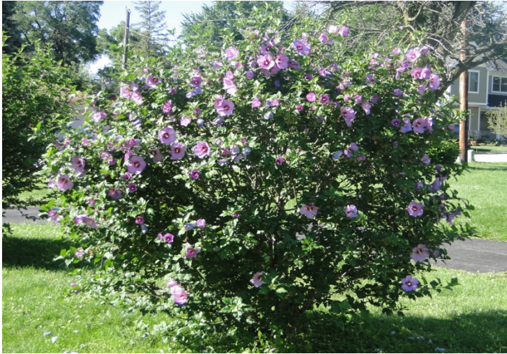
Figure 17: Rose of Sharon