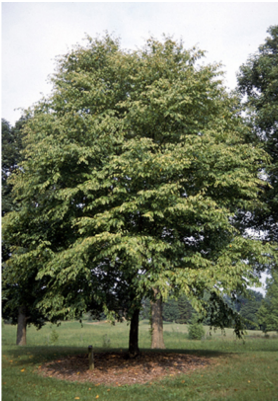
Figure 30: Black Birch