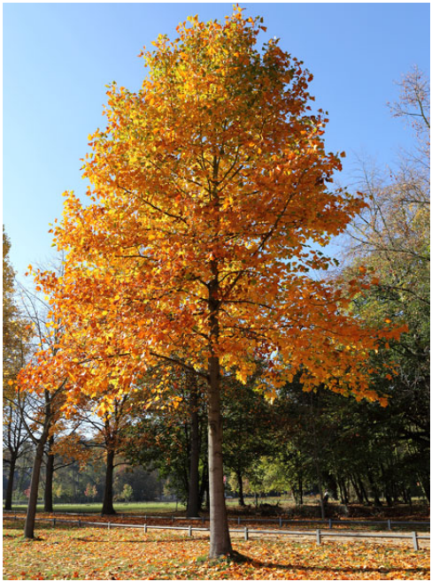
Figure 29: Tulip Poplar