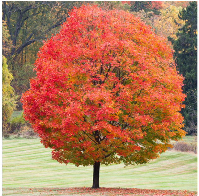
Figure 21: Sugar Maple