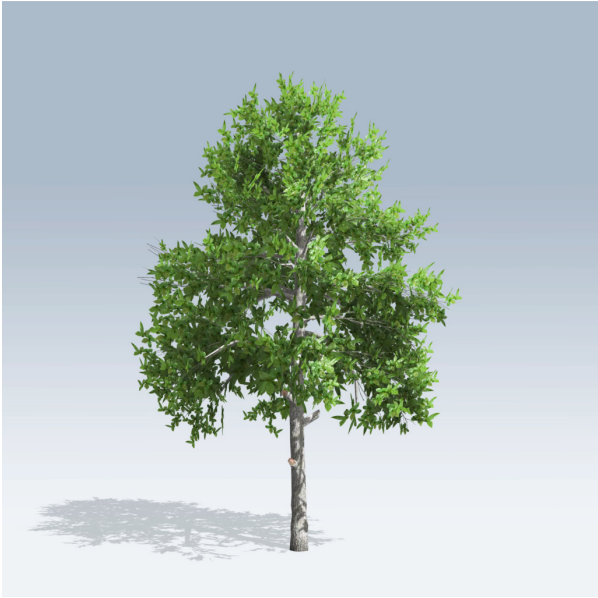
Figure 20: Black Gum Tree