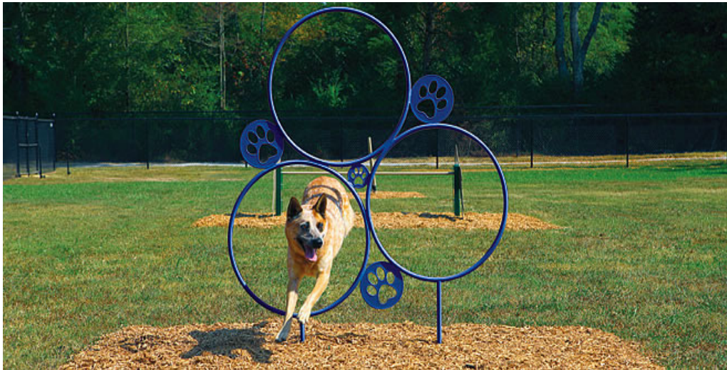
Figure 9: Large Dog Hoop Jump