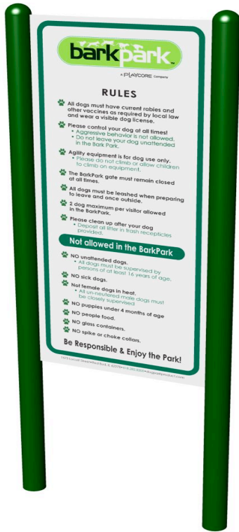
Figure 3: Rules Sign should look like this