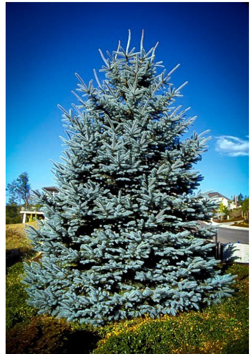
Figure 15: Blue Spruce