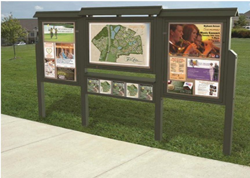
Figure 4: 3 Panel Sign of how it should be laid out, maybe with slight bend to make it tri-fold esque