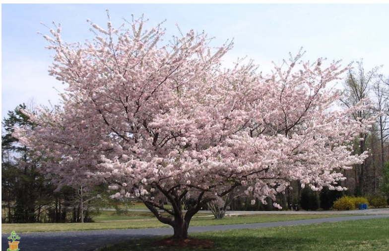
Figure 28: Yoshino Cherry