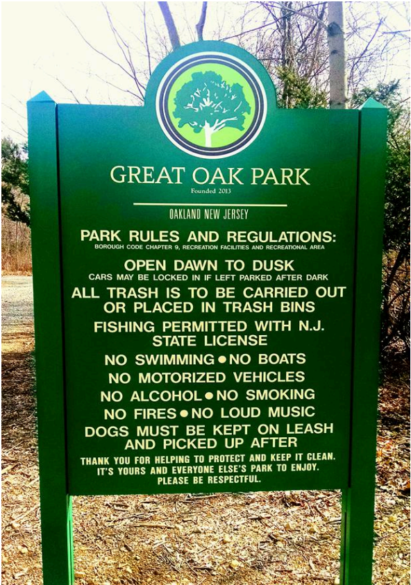
Figure 5: Sign should look close to this