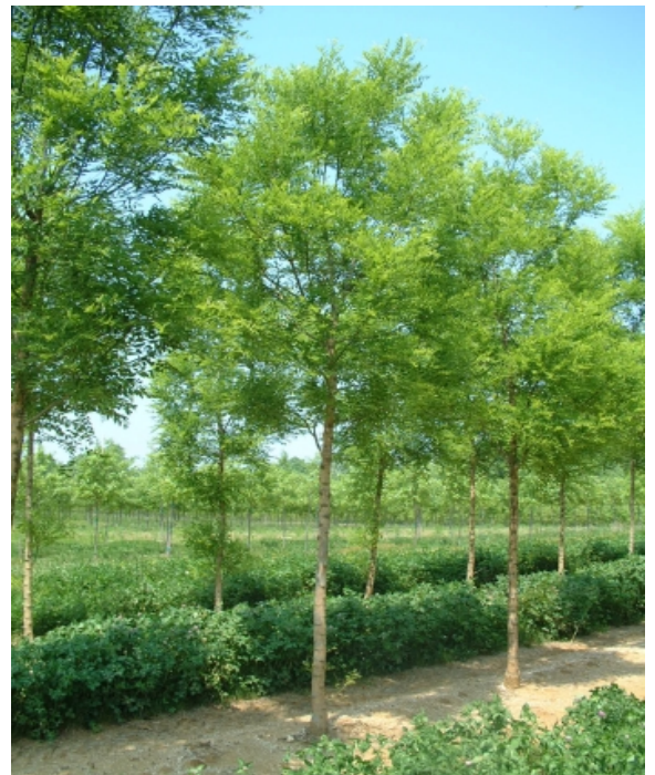
Figure 27: Sophora Japonica 'Princeton Upright'