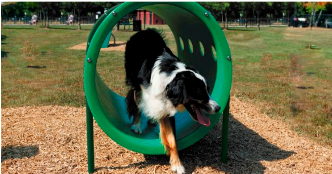
Figure 8: Doggie Crawl: 1 in each park