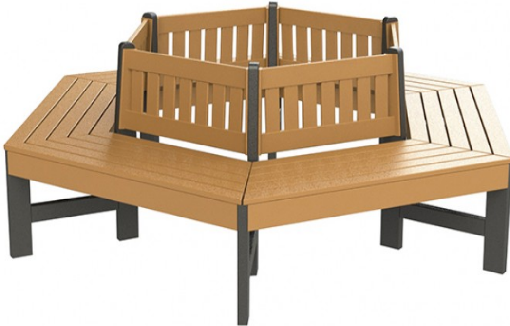
Figure 1: Tree Bench