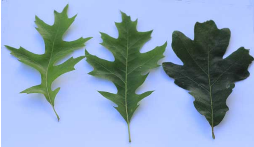
Figure 23: Red Oak, Pin Oak, White Oak