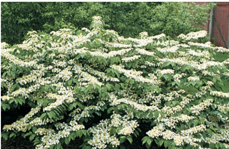
Figure 19: Viburnum